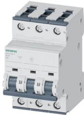
Miniature circuit breaker 400 V 10kA, 3-pole, C, 6 A, D=70 mm