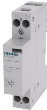
INSTA contactor with 2 NC contacts Contact for 230 V AC, 400V 20A Control 230 V AC